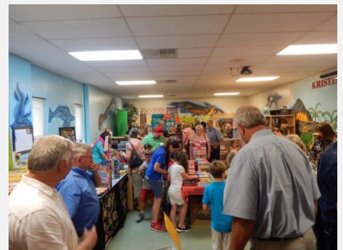
Book Fair & Grandparents' Lunch